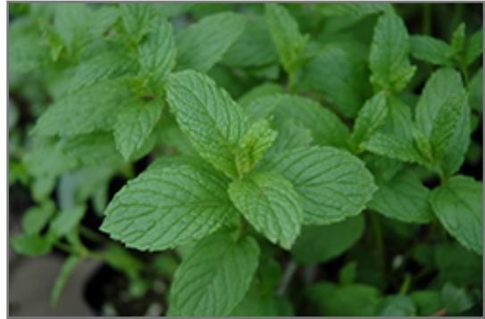
The Best Spearmint foliage