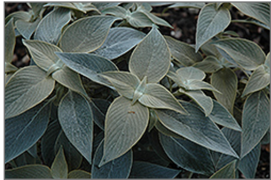
Persian Shield foliage

Persian Shield will grow to be about 3 feet tall at maturity, with a spread of 3 feet. It has a low canopy. It grows at a fast rate, and under ideal conditions can be expected to live for approximately 10 years.