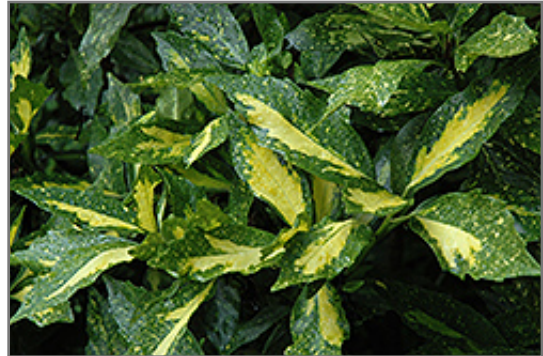
Picturata Aucuba foliage

A spectacular evergreen that solves the problem of shaded indoor areas with wonderful contrasting foliage; an excellent houseplant that is easy to care for