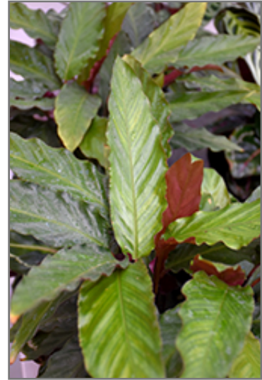
Stromanthe foliage

When grown indoors, Stromanthe can be expected to grow to be about 3 feet tall at maturity, with a spread of 3 feet. It grows at a medium rate, and under ideal conditions can be expected to live for approximately 10 years. This houseplant will do well in a location that gets either direct or indirect sunlight, although it will usually require a more brightly-lit environment than what artificial indoor lighting alone can provide. It prefers to grow in average to moist soil. The surface of the soil shouldn't be allowed to dry out completely, and so you should expect to water this plant once and possibly even twice each week. Be aware that your particular watering schedule may vary depending on its location in the room, the pot size, plant size and other conditions; if in doubt, ask one of our experts in the store for advice. It is not particular as to soil pH, but grows best in rich soil. Contact the store for specific recommendations on pre-mixed potting soil for this plant.