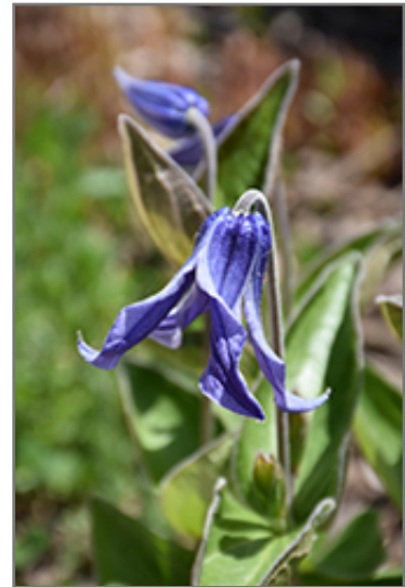
Blue Ribbons Bush Clematis flowers