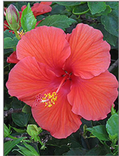
Red Darling Hibiscus

This tropical plant does best in full sun to partial shade. It requires an evenly moist well-drained soil for optimal growth, but will die in standing water. It may require supplemental watering during periods of drought or extended heat. It is not particular as to soil pH, but grows best in rich soils. It is highly tolerant of urban pollution and will even thrive in inner city environments. Consider applying a thick mulch around the root zone in winter to protect it in exposed locations or colder microclimates. This is a selected variety of a species not originally from North America. It can be propagated by cuttings; however, as a cultivated variety, be aware that it may be subject to certain restrictions or prohibitions on propagation.