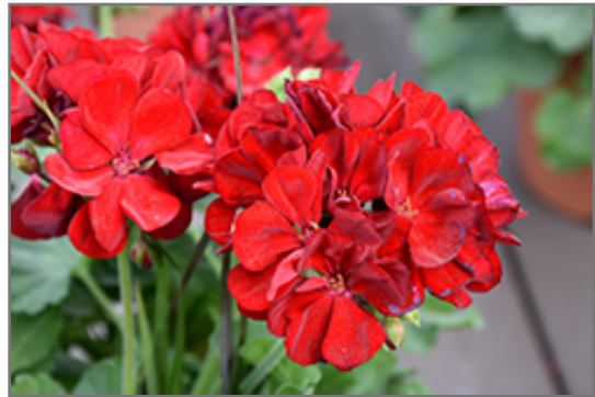
Calliope Medium Dark Red Geranium flowers