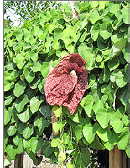
Giant Dutchman's Pipe flowers