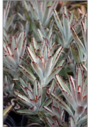
Panda Plant foliage

A pretty accent plant for a bright indoor area; oblong, gray-green leaves with reddish-brown spots have a unique felted texture; displays chartreuse flowers that are tinged with purple; a great houseplant that is easy to grow