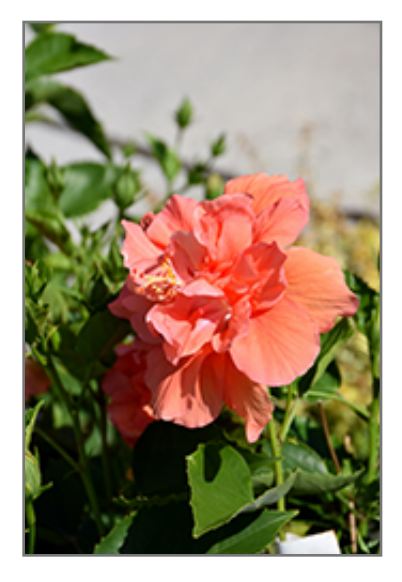
Tangerine Dream Hibiscus flowers

Bandera Location 8516 Bandera Road San Antonio, TX 78250 (210) 680-2394