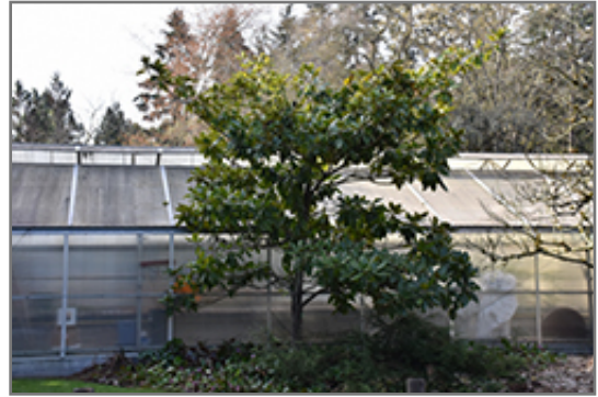
Majestic Beauty Magnolia

This tree does best in full sun to partial shade. It requires an evenly moist well-drained soil for optimal growth, but will die in standing water. It may require supplemental watering during periods of drought or extended heat. It is not particular as to soil type, but has a definite preference for acidic soils. It is somewhat tolerant of urban pollution, and will benefit from being planted in a relatively sheltered location. Consider applying a thick mulch around the root zone in winter to protect it in exposed locations or colder microclimates. This is a selection of a native North American species.