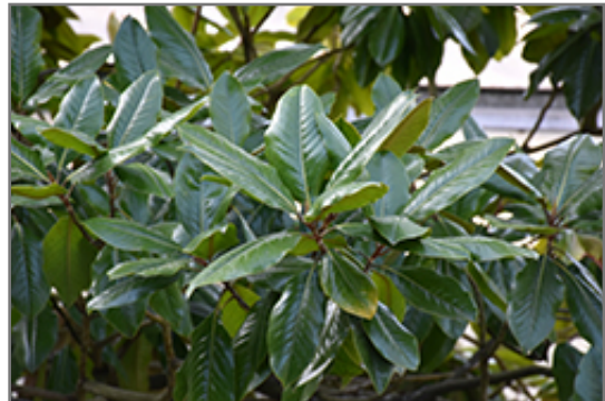
Majestic Beauty Magnolia foliage