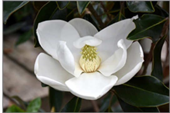
Majestic Beauty Magnolia flowers

Majestic Beauty Magnolia is recommended for the following landscape applications;