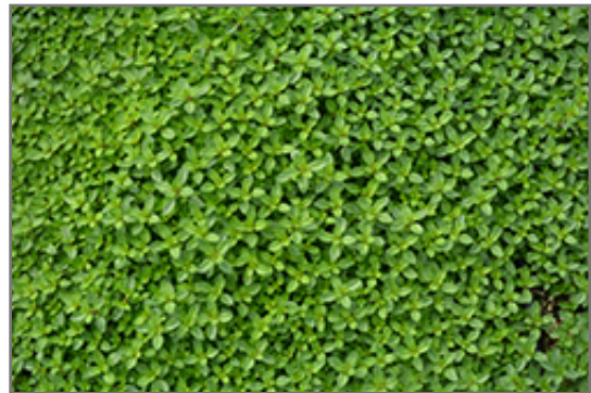
Creeping Thyme foliage