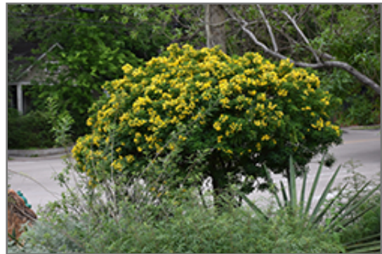
Argentine Senna in bloom