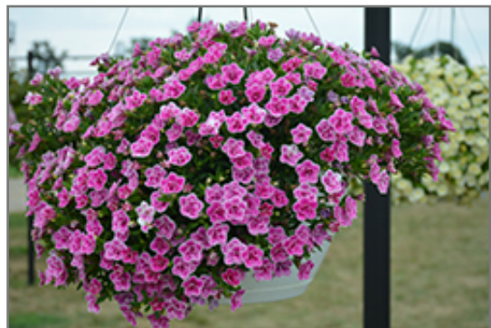
Superbells Doublette Love Swept Calibrachoa in bloom