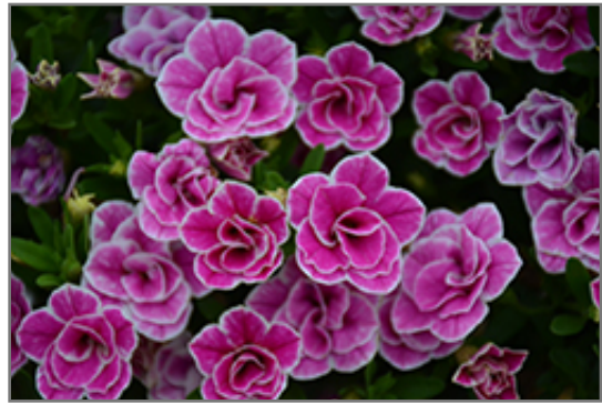
Superbells Doublette Love Swept Calibrachoa flowers

Superbells Doublette Love Swept Calibrachoa is a dense herbaceous annual with a trailing habit of growth, eventually spilling over the edges of hanging baskets and containers. Its medium texture blends into the garden, but can always be balanced by a couple of finer or coarser plants for an effective composition.