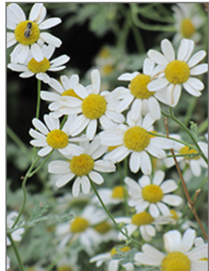
German Chamomile flowers