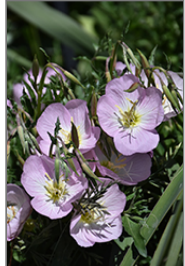
Evening Primrose flowers