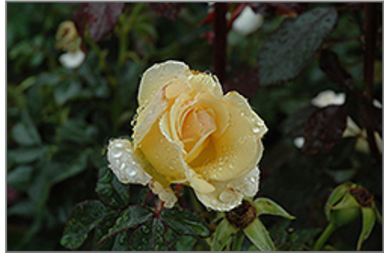
Centennial Rose flowers