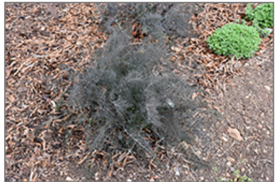
Bronze Fennel