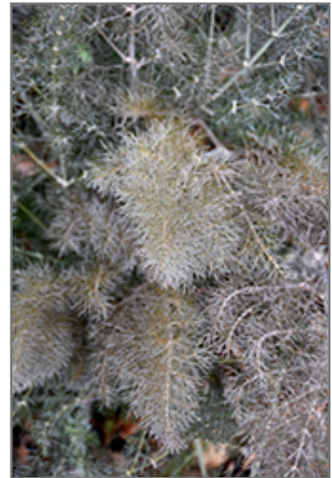
Bronze Fennel foliage

Bronze Fennel has masses of beautiful chartreuse flat-top flowers held atop the stems in mid summer, which are most effective when planted in groupings. The flowers are excellent for cutting. Its attractive fragrant ferny leaves emerge coppery-bronze in spring, turning bluish-green in color with hints of coppery-bronze throughout the season.