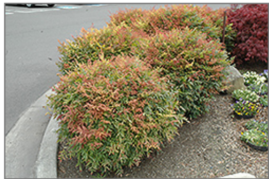
Sienna Sunrise Nandina