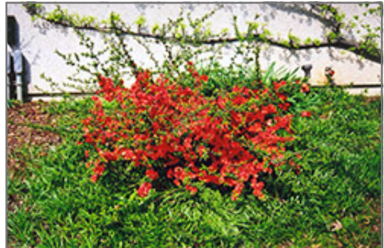
Common Flowering Quince in bloom

This is a high maintenance shrub that will require regular care and upkeep, and should only be pruned after flowering to avoid removing any of the current season's flowers. Gardeners should be aware of the following characteristic(s) that may warrant special consideration;