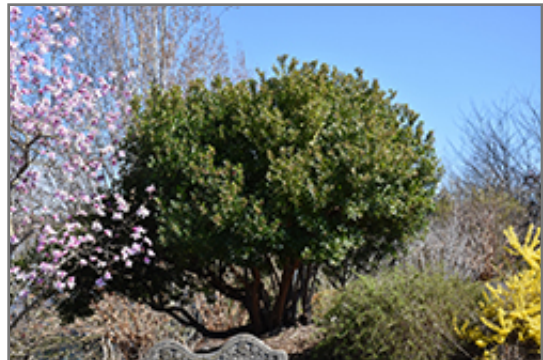
Strawberry Tree