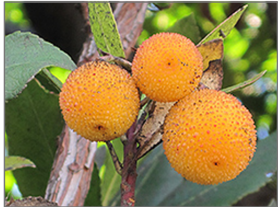
Strawberry Tree fruit

Strawberry Tree is recommended for the following landscape applications;