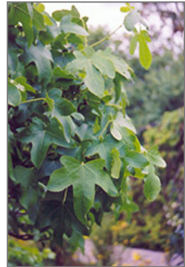
Round Leaf Sweet Gum foliage

Round Leaf Sweet Gum will grow to be about 50 feet tall at maturity, with a spread of 30 feet. It has a high canopy of foliage that sits well above the ground, and should not be planted underneath power lines. As it matures, the lower branches of this tree can be strategically removed to create a high enough canopy to support unobstructed human traffic underneath. It grows at a fast rate, and under ideal conditions can be expected to live for 70 years or more.