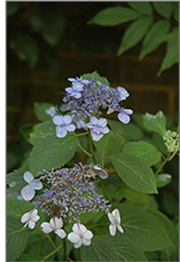
Blue Billow Hydrangea flowers

Blue Billow Hydrangea will grow to be about 4 feet tall at maturity, with a spread of 6 feet. It has a low canopy. It grows at a medium rate, and under ideal conditions can be expected to live for approximately 30 years.